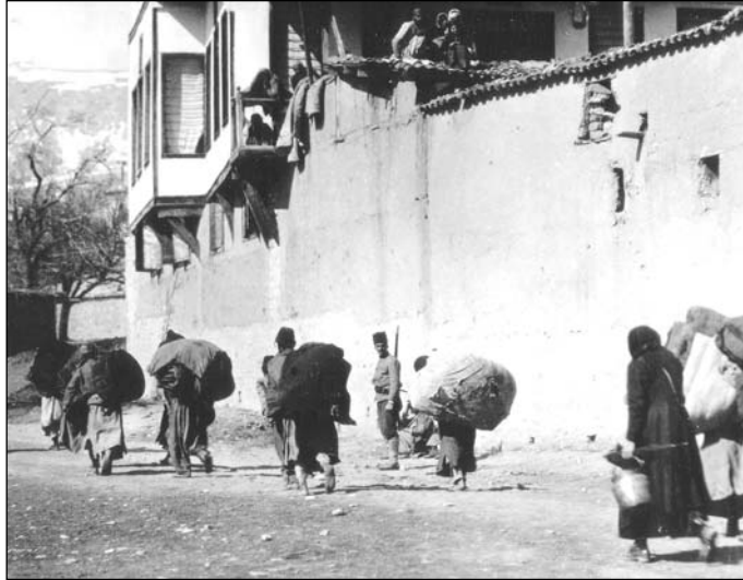
Armenian deportees returning home to Marash from exile. Marash, Cilician Armenia, Ottoman Empire, 1919.